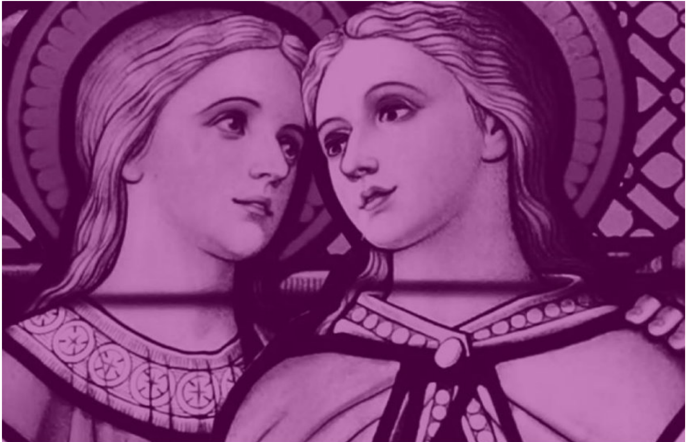
The church's logo

Opinion: It's known as the Pussy Church and it's harmful